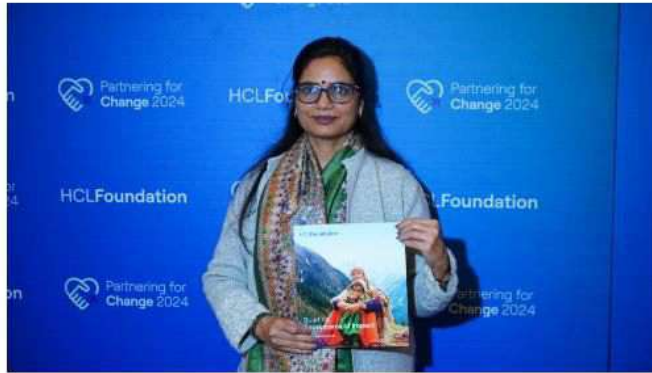
Empowering communities and transforming lives through collaboration

HCLFoundation commemorated the 7th edition of its transformative gathering, dubbed 'Partnering For Change,' or the Annual Partners Meet. The alliance forged by HCLFoundation burgeons consistently year after year. Originating with a modest 30 partners in 2016 across 4 districts, the network now boasts over 200 partners spread across 20 States in India. These collaborators, primarily non-governmental organizations (NGOs), reap the rewards of corporate social responsibility (CSR) engagement.