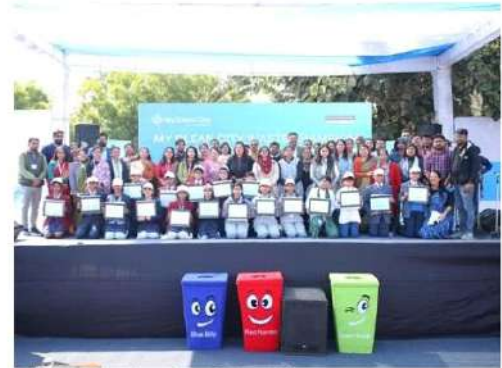
My Clean City Waste Champion Program: Empowering Students to Lead Change