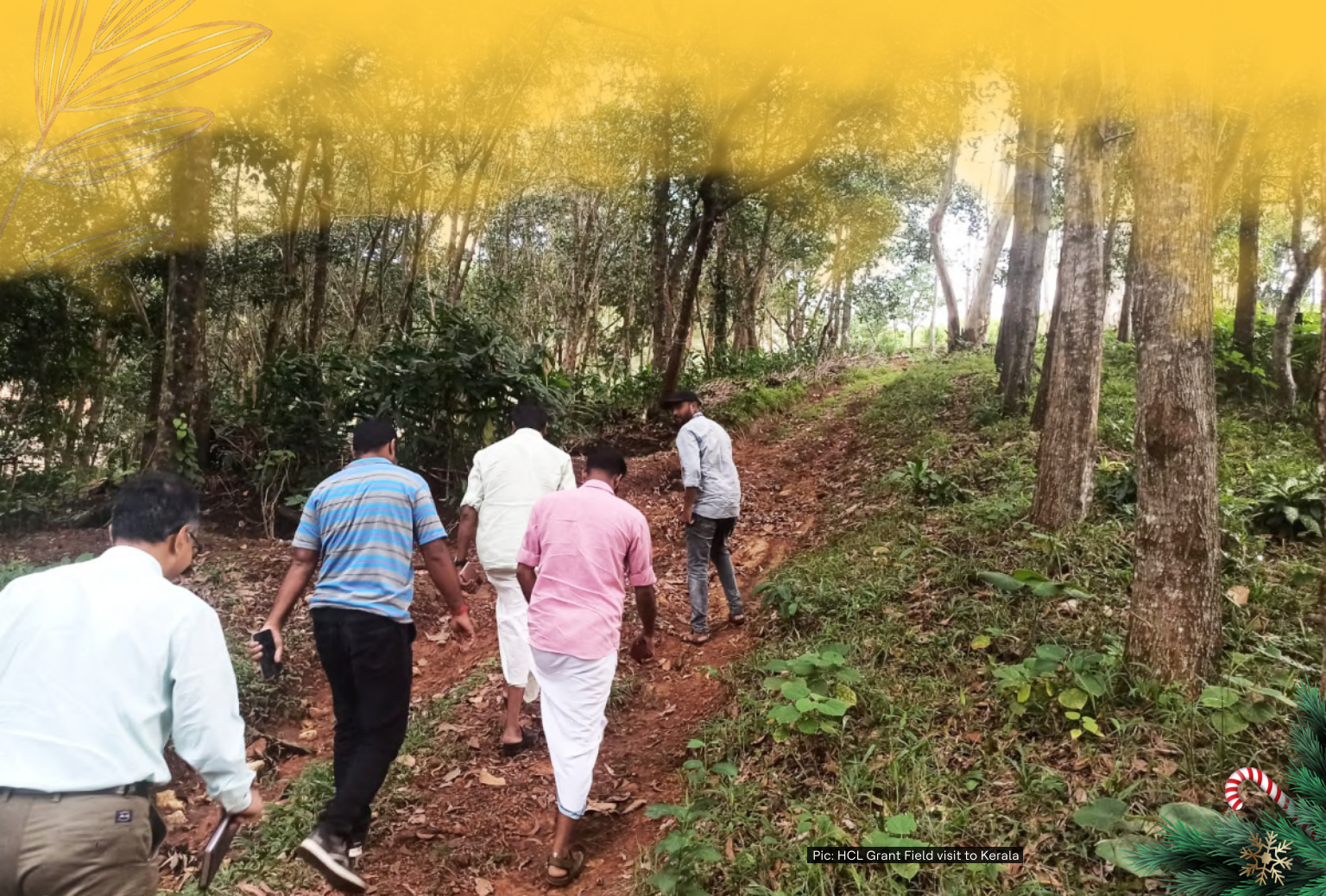
Pic: HCL Grant Field visit to Kerala