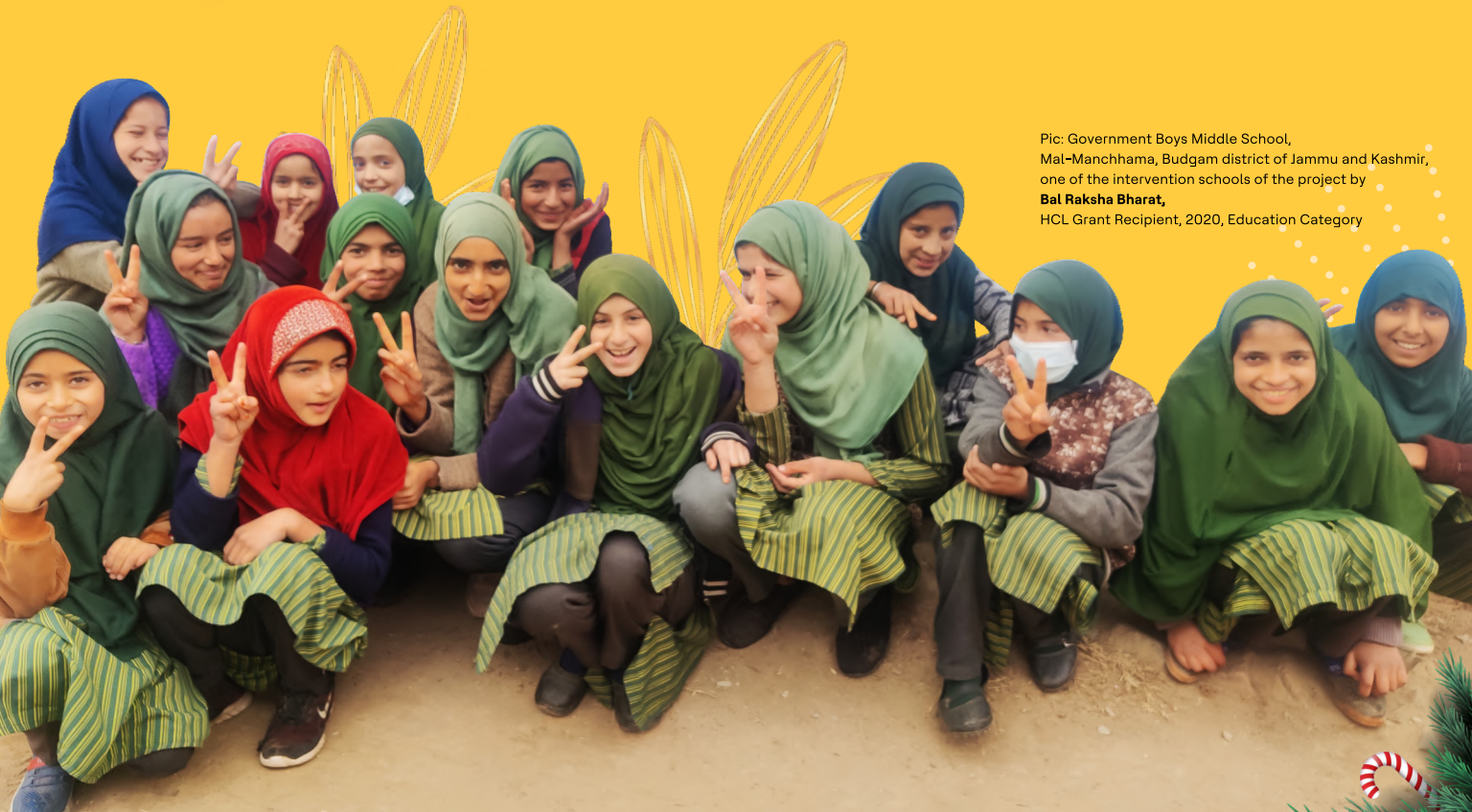
Pic: Government Boys Middle School, Mal-Manchhama, Budgam district of Jammu and Kashmir, one of the intervention schools of the project by Bal Raksha Bharat , HCL Grant Recipient, 2020, Education Category