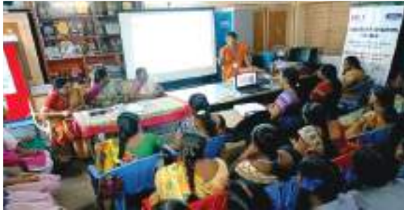
Menstrual cup usage sensitization session conducted for school heads, teachers and students under My School