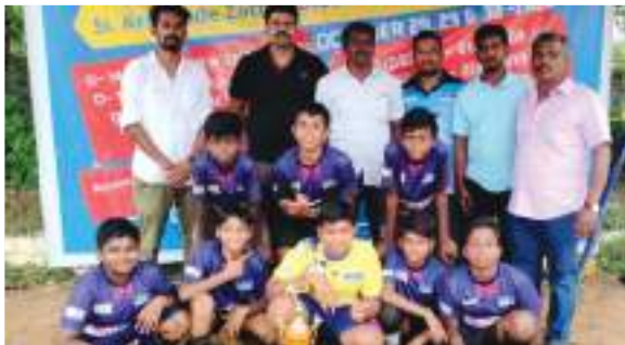
U-12 State Level Championship in Football Tournament held at Madurai