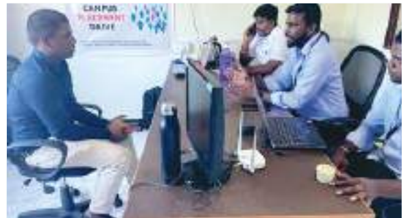
Placement Drive conducted for the candidates who completed AC & Refrigeration Mechanic course from Grey Sim Learning Foundation. Two companies participated in the drive and selected around 25 candidates, with an initial salary of ₹12,500/-.