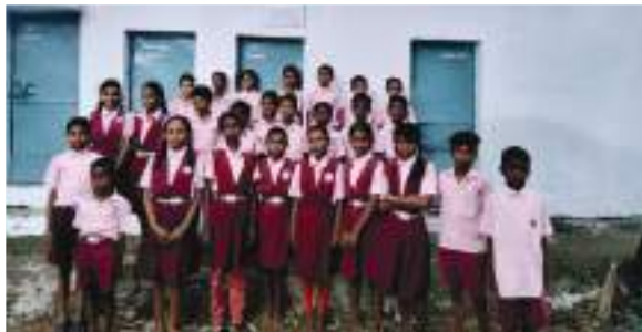
A Toilet block was recently renovated at the school, providing access to safe sanitation to close to 110 children.