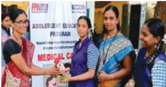
588 children received Nutrition Supplement under My School Programme