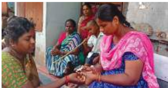
62 community members are screened for Diabetes and Hypertension at their door step