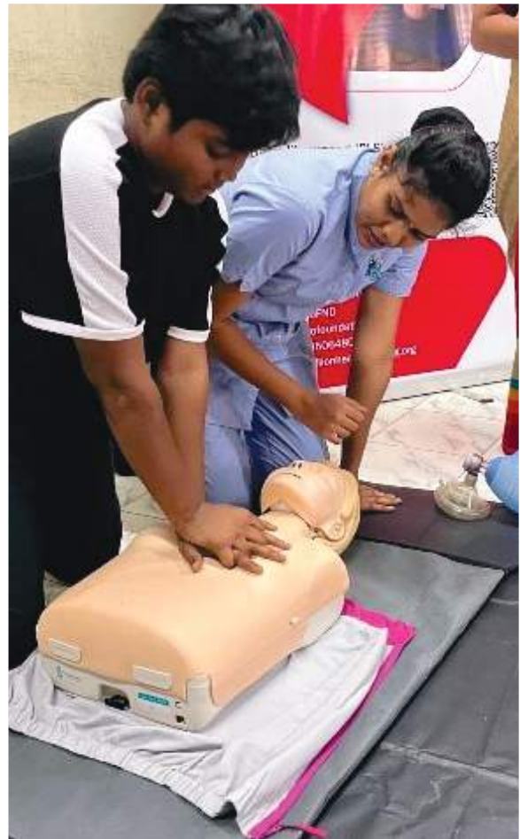
Basic Life Support (BLS) and first aid awareness programme was organized by HCL Foundation interns in coordination with Grey Sim Learnings Foundation for the students of Yuvakendra skill development center, supported by HCL Foundation. 35 candidates took part in the session. It was organized in association with Apollo Hospital's CSR initiative "Billion Hearts Beating Foundation". Two senior faculty and a students from Apollo College of Nursing demonstrated offering first response in emergency situations like road accidents, fire mishaps, electrocution etc. Demonstration of CPR was the attraction of the programme and all the students participated in the practical session. Students got a chance to learn about giving first aid to a person with the help of model and they were eager to learn new things.