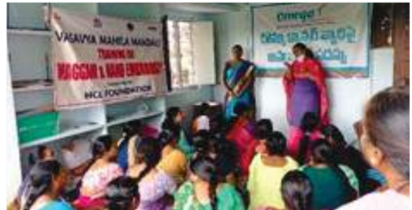
29 women participated in breast cancer awareness session conducted at Allapuram