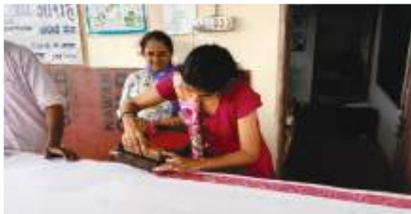
Over 30 women from the Wadi training center were trained in the block printing art. Artists from Rajasthan along with Local experts imparted the 3 day training. This is expected to help the women in adding variety to the products that they are making as a part of their training under apparel trade.