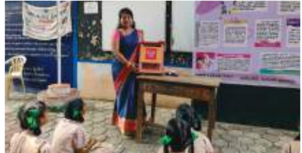
"Dropbox" System introduced in My school programme on World Mental Health Day