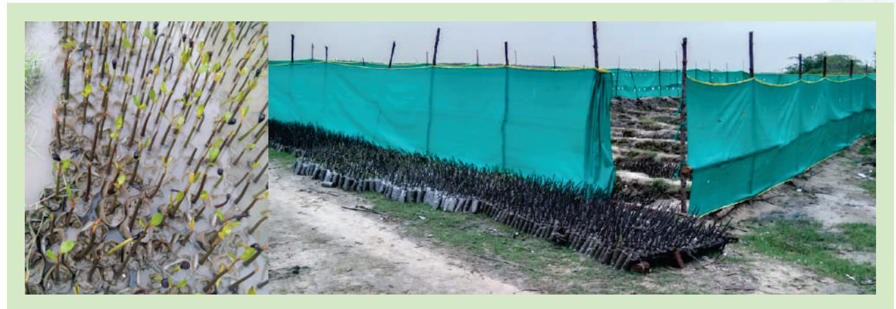
Established mangrove plants nursery with 30,000 saplings at Chinnagollapalem, Vijayawada. The saplings will further to be planted along the coast line to prevent soil erosion.