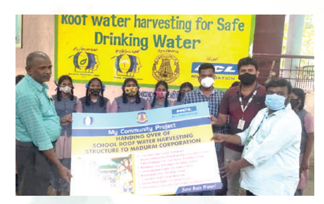
9 Roof Water Harvesting Systems handed over to the school heads in our out My school program in Madurai