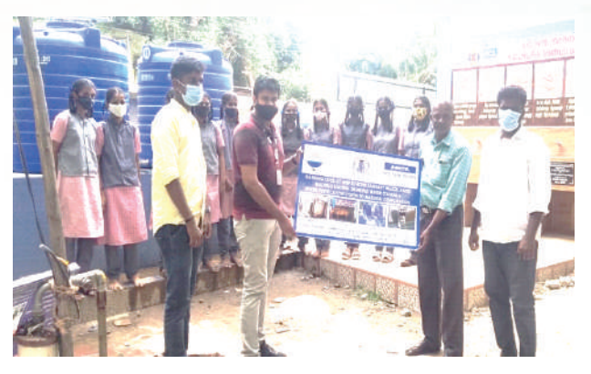
2 Sanitary Blocks were handed over to the School heads in our My School Program in Madurai