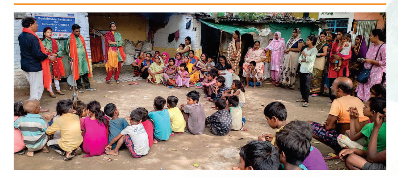
Street play organized at shram vihar colony, Lucknow to generate awareness on importance of toilets, personal hygiene and cleanliness, participate in governance process to avail services and eliminate open defecation.