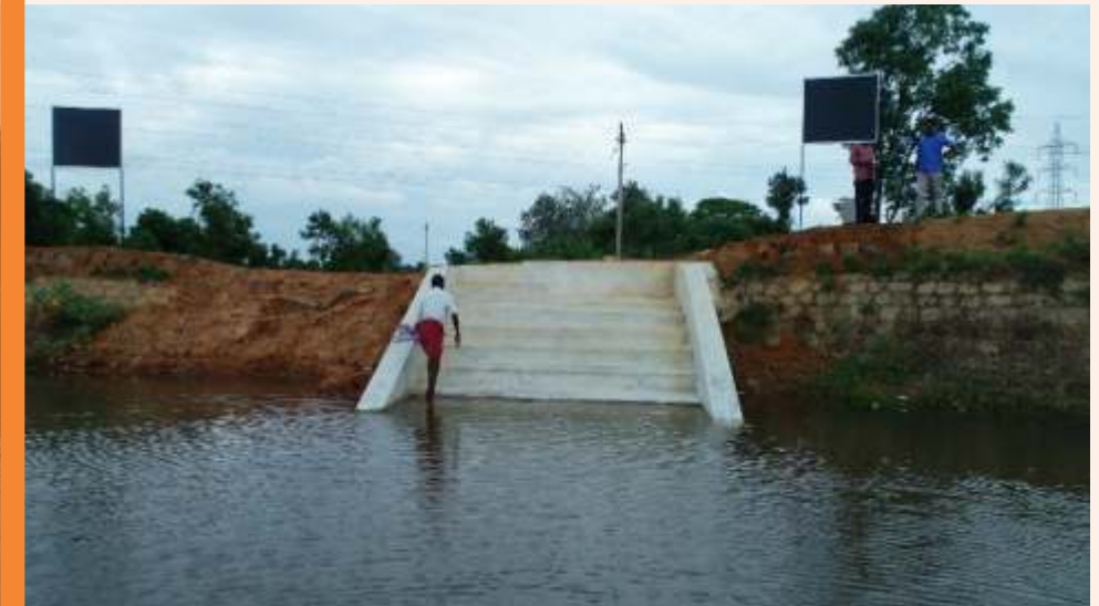
The steps were constructed to aid the communities