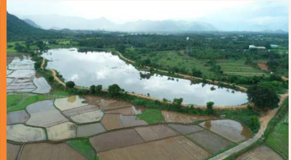
Aladikulam tank after restoration