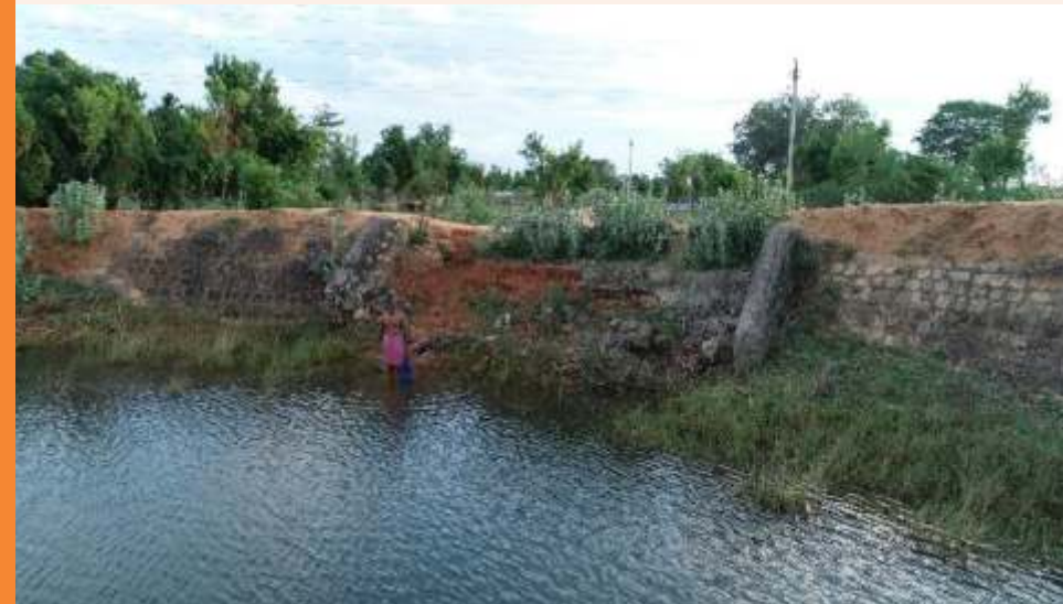
The steps before restoration