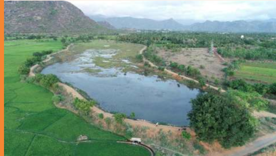
Aladikulam tank before restoration activities were undertaken

To demonstrate a model irrigation tank, Aladikulam irrigation tank (17 acres' tank) of Tirunelveli district, Tamil Nadu has been successfully restored by Ashoka Trust Research in Ecology & Environment, HCL Grant Finalist, 2020 Environment Category through de-siltation, construction of steps and removal of invasive species like Prosopis juliflora and Ipomea carnea , benefitting locals and wildlife of Kalakad Mundanthurai Tiger Reserve (KMTR).