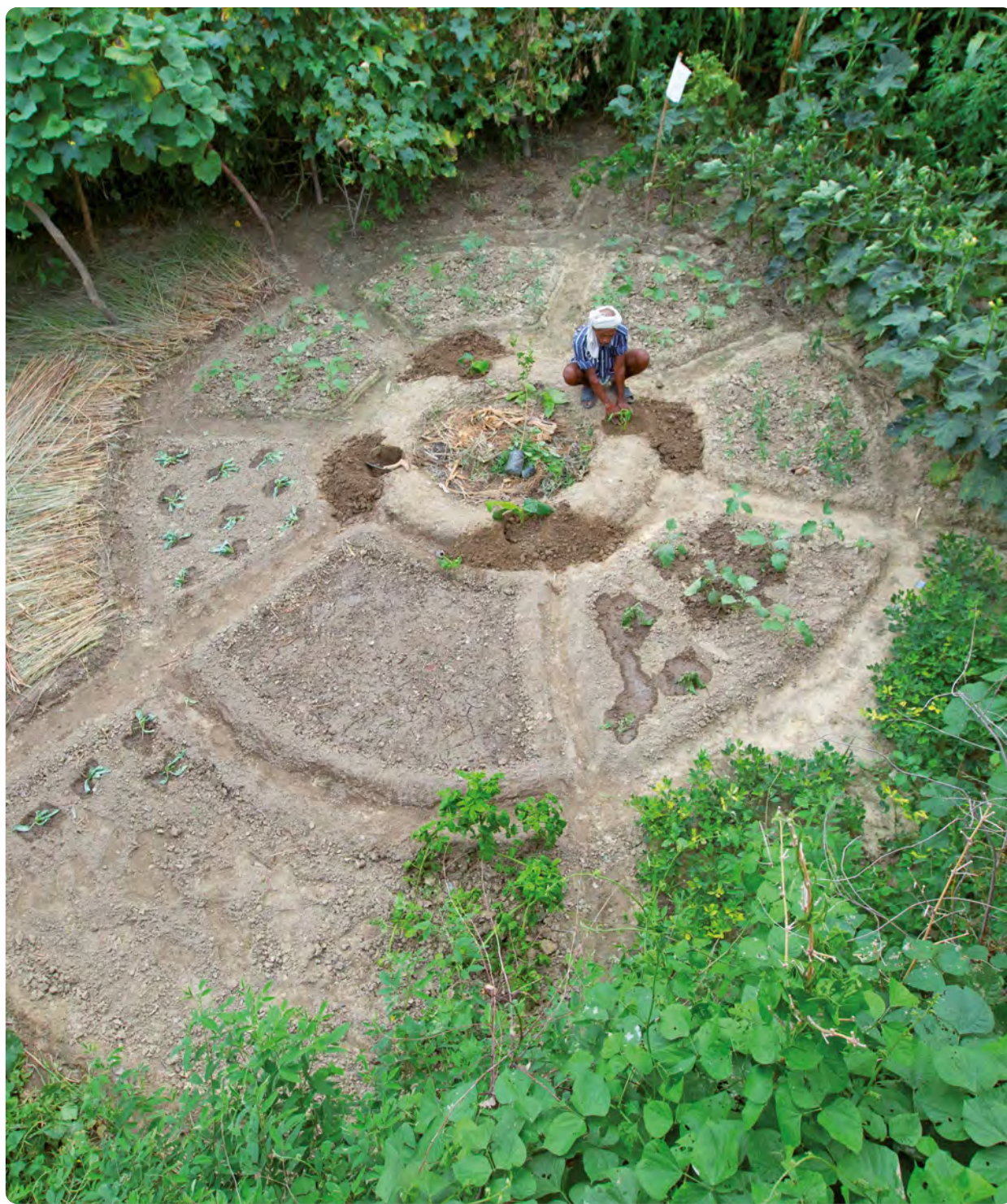
Sowing the seeds of progress