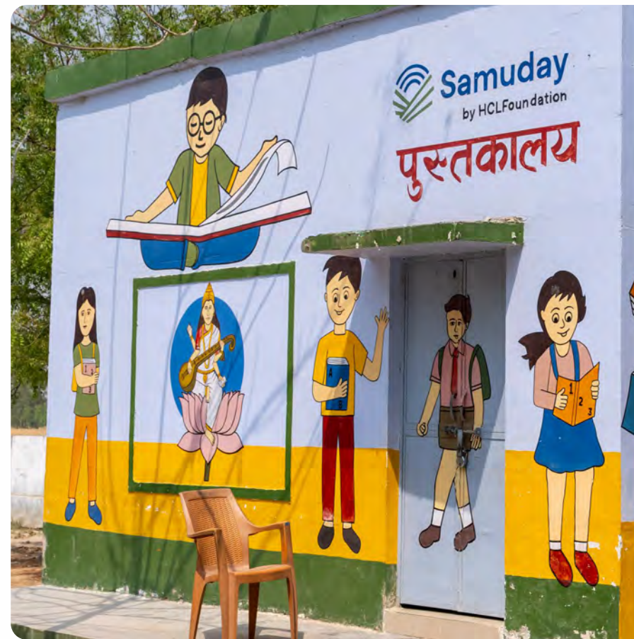
Resources within reach