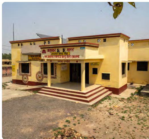
Restoring and reviving rural healthcare