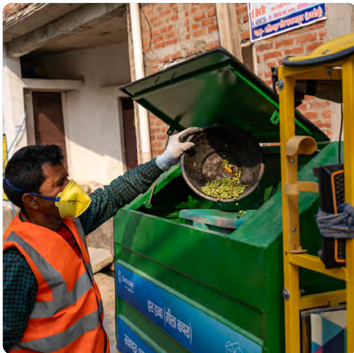
Cleaning the way to hygienic living