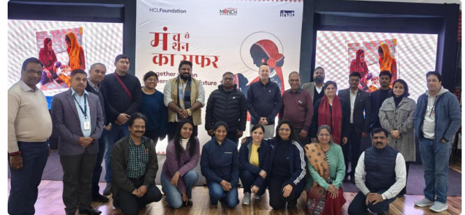
Briefing of Project MANCH by IHAT

Health Action Trust, Child Rights and You and The Corbett Foundation. The visit provided a first-hand experience of the transformative impact these initiatives have had on the communities they serve.