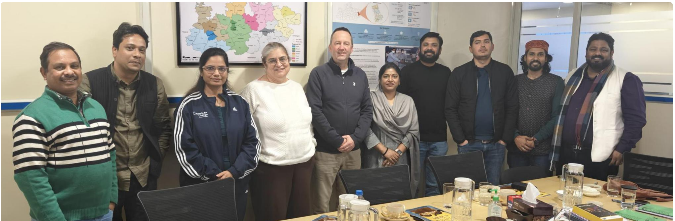
HCLFoundation delegation visiting CRY office in Guna