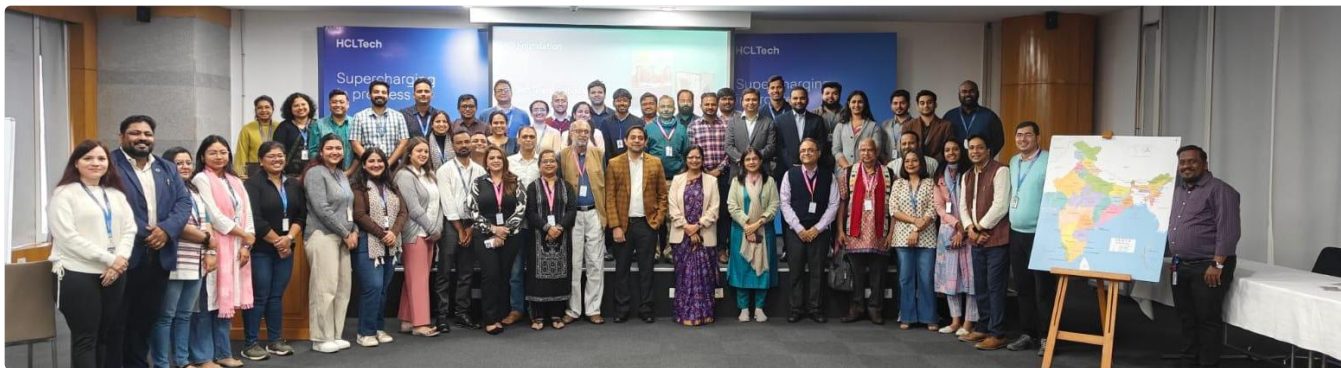
HCLTech Grant Edition X Consolidation Meeting

Following a rigorous quest for the Edition X winners of HCLTech Grant by HCLFoundation, we are ready with the list of the top 30 Non-Governmental Organizations in the categories of Environment, Health and Education. In the consolidation meeting held on 3rd December 2024, Subject Matter Experts, HCLFoundation team members and the governance partner shortlisted 10 NGOs in each category on the basis of field visits made to 52 NGOs across the length and breadth of the country. The path-breaking work of these shortlisted NGOs will be published in the 9th Edition of The Fifth Estate – the compendium of HCLTech Grant.