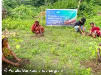
Purulia Bankura and Jhargram