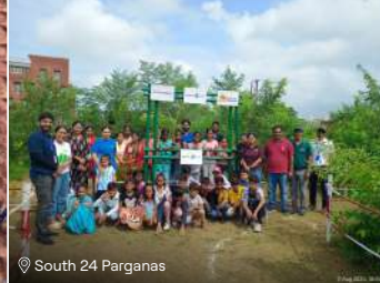
South 24 Parganas