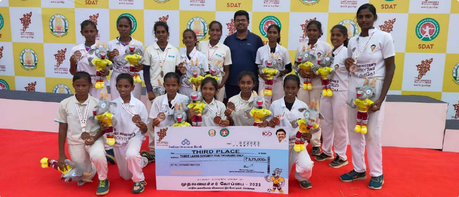
Women's cricket players from the Govt Girls Hr. Sec School, Avadi after winning the Bronze medal at the Chief Minister's trophy, 2023, Tamil Nadu.

satisfaction over monetary gains. This also means that having good people around and finding fulfillment in one's work is important. I always say, "Empathize with the other person. Then you can never go wrong."