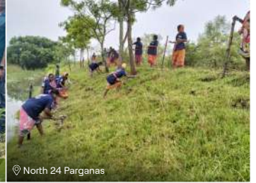
North 24 Parganas