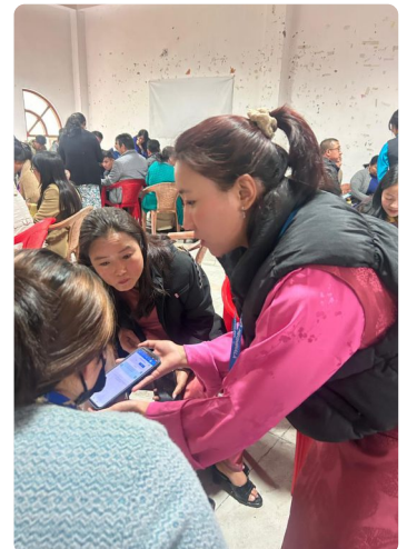
Inauguration of E-connect program, Meghshala Trust, Sikkim