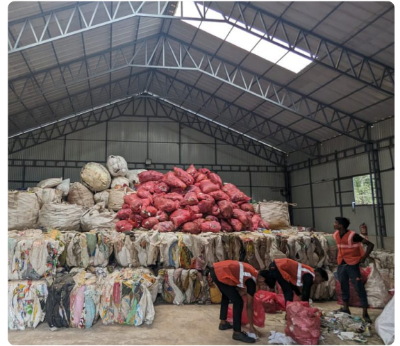
Plastic waste collected and artwork created by PlanatEarth, Cochin, Kerala