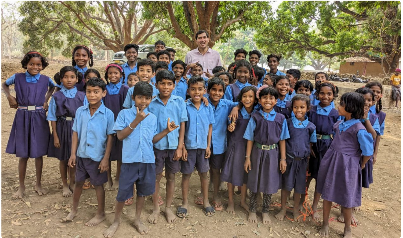
School children supported by Language and Learning Foundation, Bastar, Chattisgarh