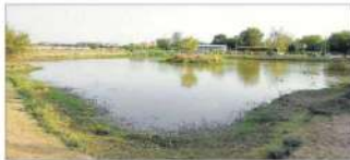
The pond in Chauganpur village in Ganges' Nadia district was revived under the CSR initiative by HCL Foundation, in association with NGOs and banks.

Mania Khan The Ganges delta's huge administrative on Monday directed officials to ensure the around 1200 water ponds developed at some locations in the district to view of the water bodies which completely vanishing owing to unbridled encroachment or being filled near to go away for development work. The district's water bodies are a critical natural resource for the district, which is a deltaic region. The water bodies are a critical natural resource for the district, which is a deltaic region. The water bodies are a critical natural resource for the district, which is a deltaic region.