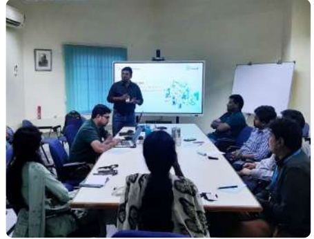
CSR Newsletter by HCLFoundation July 2024