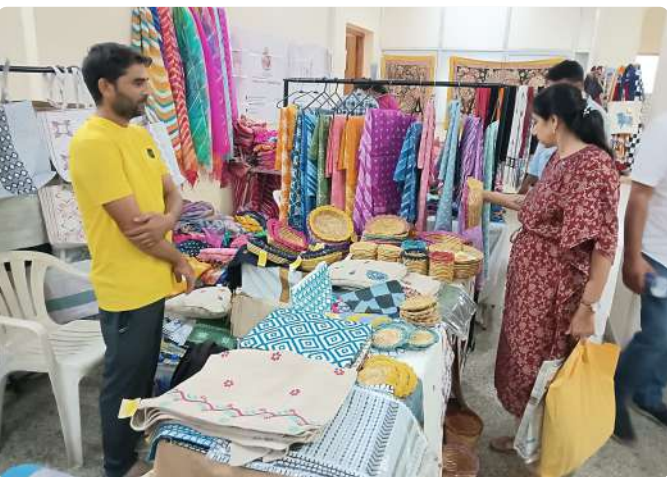
CSR Newsletter by HCLFoundation July 2024