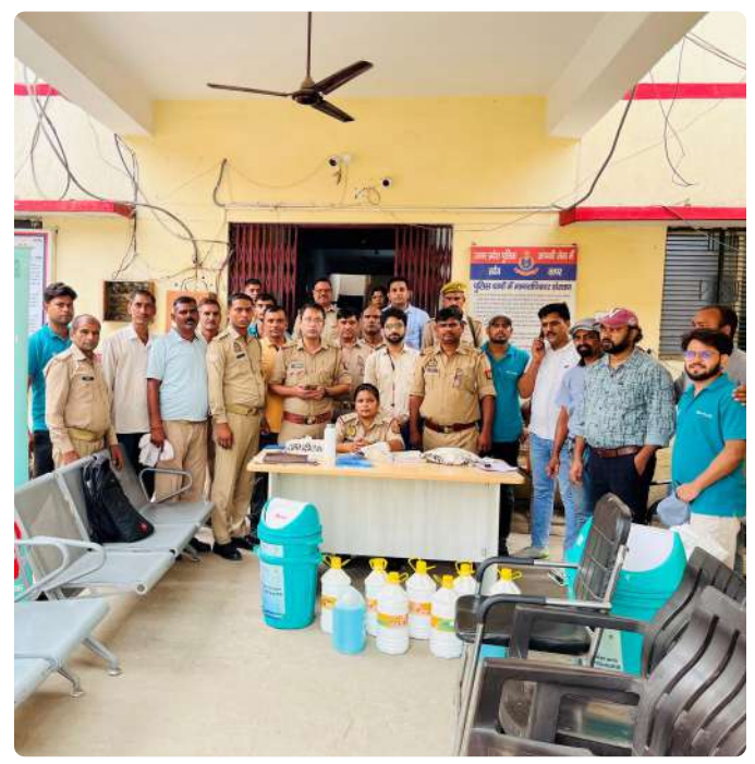
CSR Newsletter by HCLFoundation July 2024

My Clean City by HCLFoundation observed International Plastic Bag Free day with police personnel of Dadri, NSS volunteers, and commercial establishments. Marking the day by organizing various awareness sessions and activities such as signature campaign, Nukkad Natak, etc. the team raised awareness about the pervasive impact of plastic on our environment and health, sensitizing more than 100 people on the need to reduce our plastic consumption and embrace sustainable alternatives.