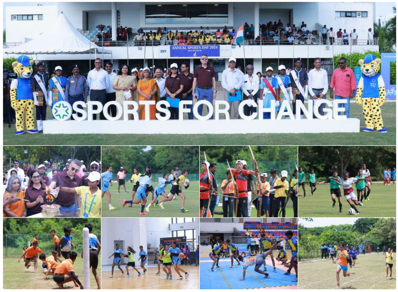
CSR Newsletter by HCLFoundation July 2024

With over 15,000 children participating this year, the program's impact is undeniable.