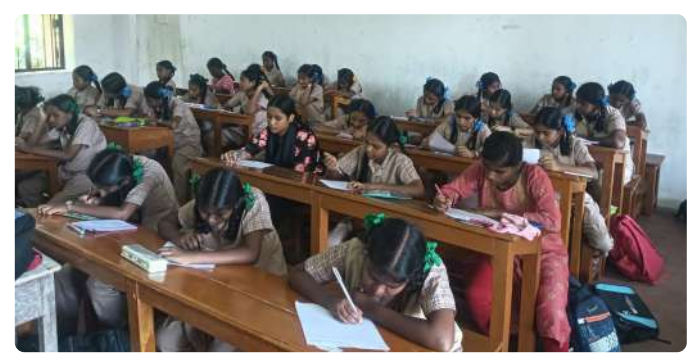
CSR Newsletter by HCLFoundation July 2024

Baseline assessment was conducted for 300+ students from 15 government schools in Chennai and Noida as part of Harit school program in partnership with TIDE & GEAG. This baseline survey will be used to assess students' understanding of climate change, environmental challenges, national & global perspectives and behavior towards environmental conservation.