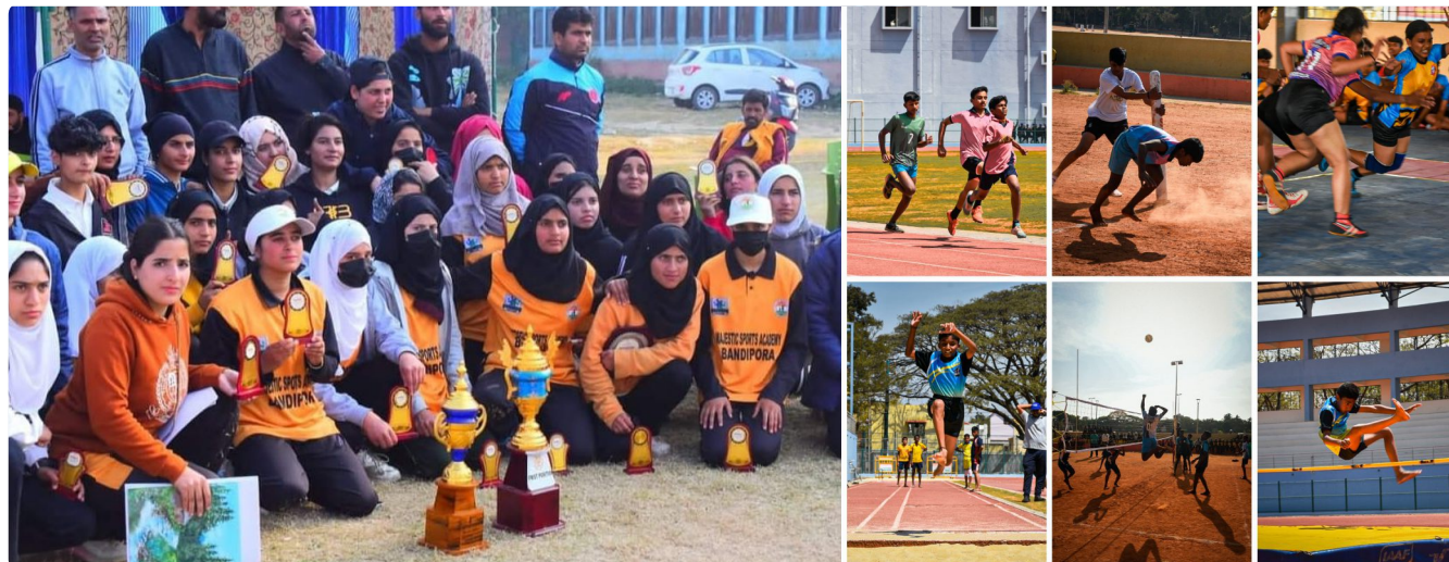
SFC District Qualifiers at She Hopes Society for Women Entrepreneurs and Bal Raksha Bharat, Jammu & Kashmir and SAAHAS, Karnataka

Karnataka. The aim of this initiative is to reach the youth from underserved communities and empower young leaders. Over 1600 children competed each other in different sports competitions in the various districts of J&K and rural Karnataka. These competitions have seen a good turnout in the past few years, highlighting the increasing awareness about the importance of sports.