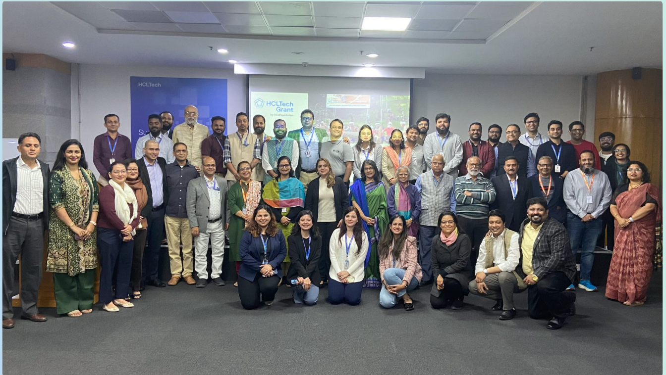
HCLTech Grant Edition IX – Consolidation Workshop

The groundwork of HCLTech Grant compendium – The Fifth Estate Edition VIII is underway. This compendium aims to celebrate the groundbreaking work of 30 NGOs across rural India that have proved their impact and credibility. The prestigious publication will feature the nature and area of each NGO's accomplished work alongside their proposed project in their respective field. These NGOs have been shortlisted by our Subject Matter Experts in the categories of Environment, Health and Education during the selection process of HCLTech Grant Edition IX.