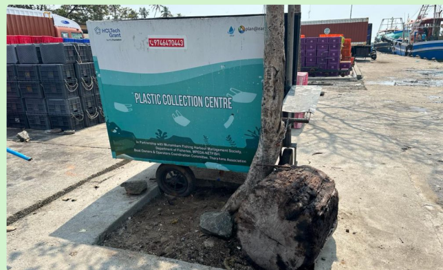
Plastic Waste Disposal Kiosk at Munambam Harbour, PlanatEarth, Kochi, Kerala

PlanatEarth, HCLTech Grant winner 2023 (Category: Environment) set up a kiosk for plastic waste disposal at Munambam Harbour. More than 47 kilos of ghost fishing gear were recovered in the kiosk including fishing nets of various sizes and materials, bits of ropes, fishing lines and damaged buoys. This poses a major threat to marine life and contributes to micro-plastic pollution. This waste is responsibly managed through recycling and upcycling initiatives. The program's success has prompted the implementing agency to consider installing similar kiosks in other harbours.