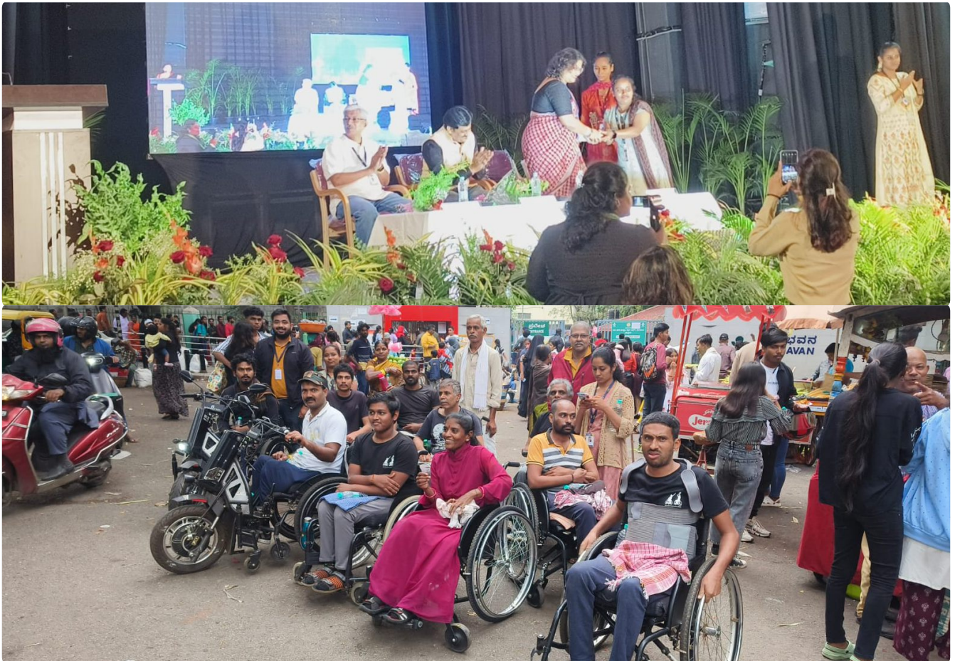
HCLTech volunteers with The Association of People with Disability at International Disability Day celebration

efficiently, including facilitating transportation for children, managing logistics, and ensuring hospitality arrangements. Their engagement, encouragement and support for the children fostered inclusivity and created memorable moments for both the children and attendees.