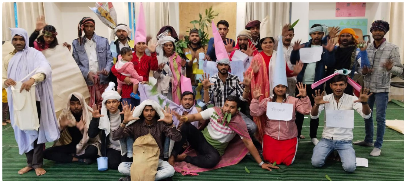
Theatre in Education workshop activities, Child Rights & You, Guna District, Madhya Pradesh