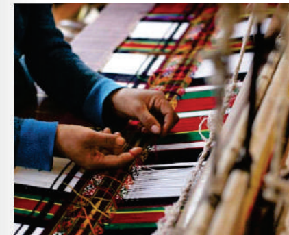
Handloom, Aizawl, Mizoram