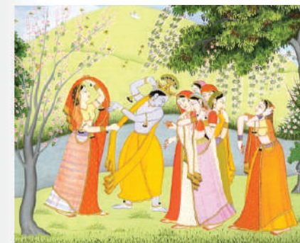
Kangra Painting, Kangra, HP