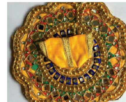
Laddu Gopal Poshak, Mathura, UP