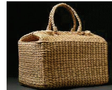
Water hyacinth handicrafts, Tinsukia, Assam