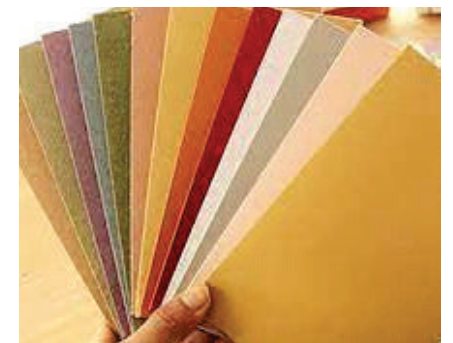
Handmade paper Products, Jalaun, UP