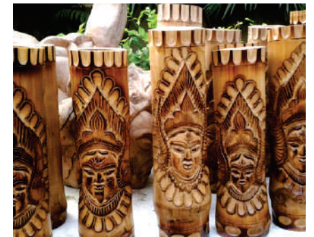
Wood and Bamboo handicrafts, Udalguri, Assam