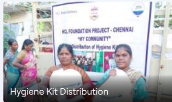
Hygiene Kit Distribution

Stationary Kits to 36 schools & 30 Gurukuls