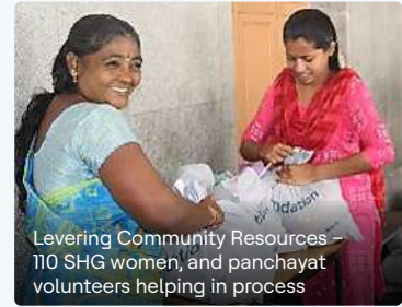
Levering Community Resources – 110 SHG women, and panchayat volunteers helping in process