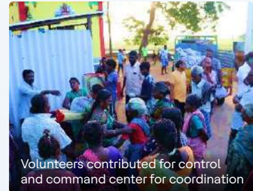
Volunteers contributed for control and command center for coordination