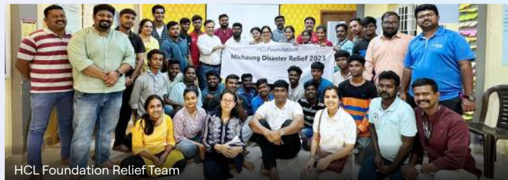
HCL Foundation Relief Team

Animal Welfare Camps & Awareness at slum communities