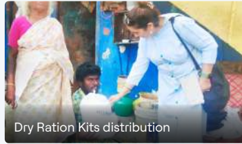
Dry Ration Kits distribution

Dry Ration Kits to flood affected families