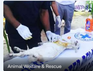
Animal Welfare & Rescue