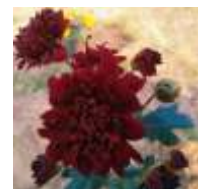
Florist's daisy (Chrysanthemum morifolium)