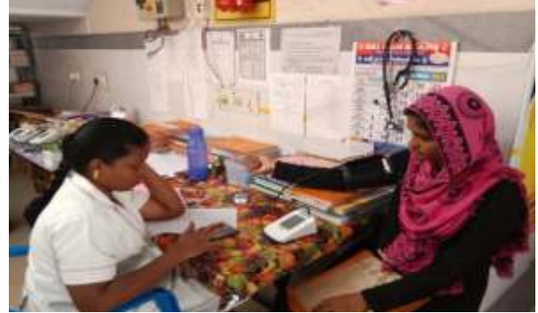
365 ANC mothers screened in the Urban Primary Health care centres through VinCense digital equipment.