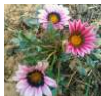
Gazania rigens (Treasure flower)