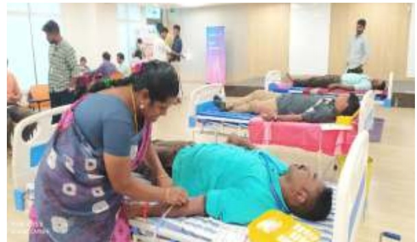
Blood Donation Drive conducted at HCLTech premises. 90 units of blood was collected. This drive was in collaboration with Government Rajaji Hospital.