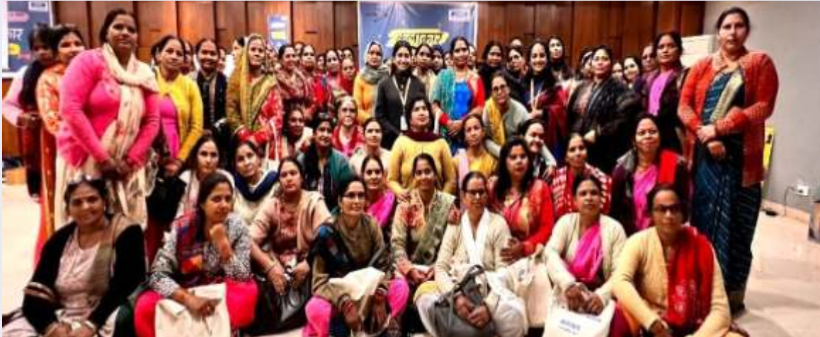
Kalaakaar – A storytelling ECCE – TLM training for 62 Anganwadi (AWC) teachers conducted in association with Nalandaway Foundation in Noida.

A team of 25 volunteers visited Primary School Bakhtavarpur at Nodia under My school intervention. Volunteers organized art and craft, drawing, sports and storytelling sessions with children. Children thoroughly enjoyed all the activities.