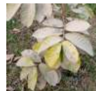
Pride of India