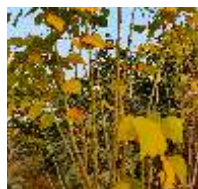
Indian Coral tree