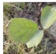
Flame of Forest