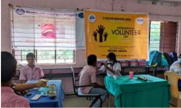
360 Children screened for identifying Oral related issues in our My school programme.