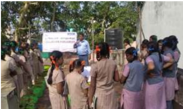
112 Children oriented on Rooftop Gardening at My School