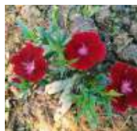
China Pink (Dianthus Chinensis)